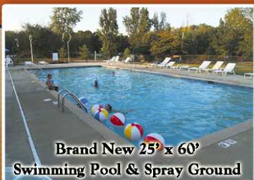
Brand New 25' x 60' Swimming Pool & Spray Ground